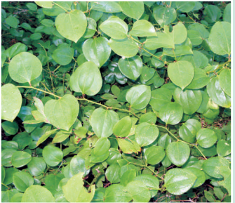
© MEGAN CROWLEY Round-leaved Greenbrier patch